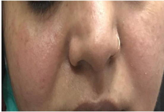
Figure-1: Contact dermatitis on the face of patients due to the use of whitening agents